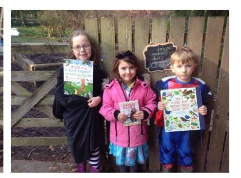
World Book Day 2020!